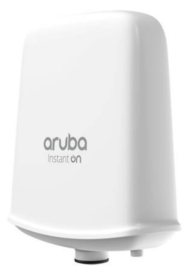
Aruba Instant On AP17 Outdoor Access Points

The Aruba Instant On AP17 outdoor access point is the ideal solution for expanding coverage and signal strength for any wireless network. The outdoor-rated enclosure is designed for harsh outdoor environments, extending quality Wi-Fi to outdoor seating areas in restaurants and cafés, or patios and swimming pools in boutique hotels.